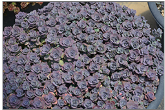
SunSparkler Blue Elf Sedoro