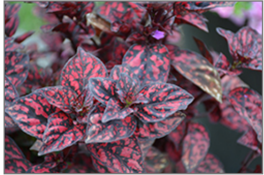
Hippo Red Polka Dot Plant foliage

Hippo Red Polka Dot Plant is recommended for the following landscape applications;