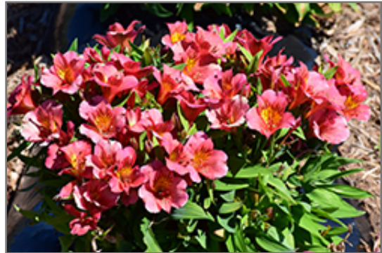
Colorita Eliane Alstroemeria in bloom