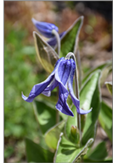
Blue Ribbons Bush Clematis flowers