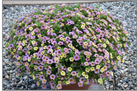
Chameleon Blueberry Scone Calibrachoa in bloom