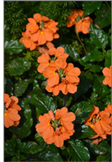
Orange Marmalade Firecracker Plant flowers

This plant does best in full sun to partial shade. It does best in average to evenly moist conditions, but will not tolerate standing water. It is not particular as to soil pH, but grows best in rich soils. It is somewhat tolerant of urban pollution. This is a selected variety of a species not originally from North America. It can be propagated by cuttings; however, as a cultivated variety, be aware that it may be subject to certain restrictions or prohibitions on propagation.