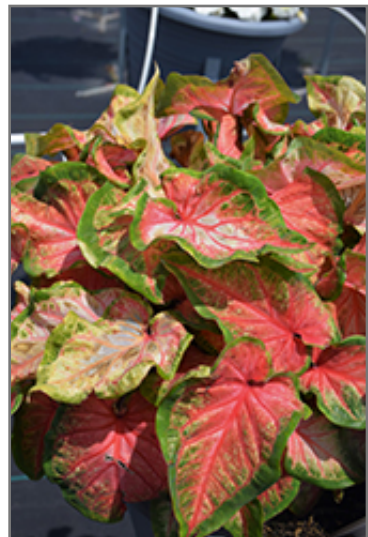
Heart to Heart Chinook Caladium foliage