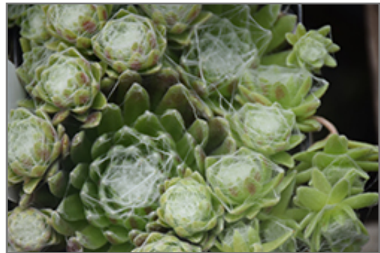
Cobweb Buttons Hens And Chicks