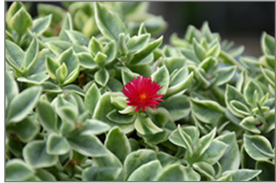
Variegated Baby Sun Rose flowers

Variegated Baby Sun Rose is recommended for the following landscape applications;