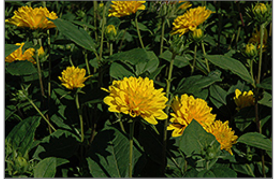
Soleil d'Or Sunflower flowers

Full, bright sunshine yellow flowers rise above large mounds of pointy dark green foliage on this vigorous variety; blooming from late summer through the fall, great for cut flower arrangements, beds and large containers