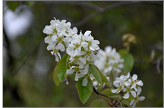
Saskatoon flowers

Saskatoon is a multi-stemmed deciduous shrub with an upright spreading habit of growth. Its relatively fine texture sets it apart from other landscape plants with less refined foliage.