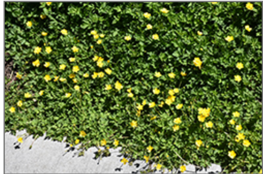
Barren Strawberry in bloom