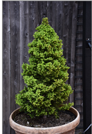
Rainbow's End Spruce