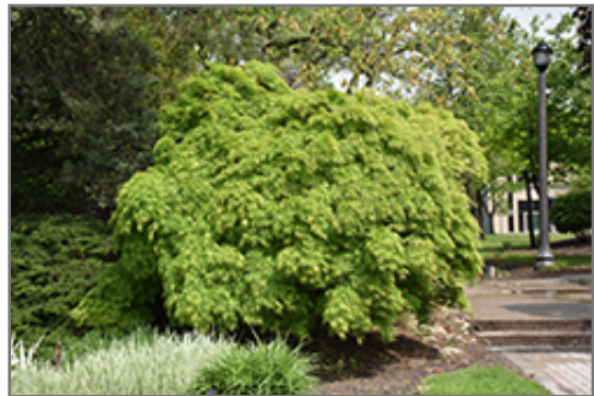
Cutleaf Japanese Maple