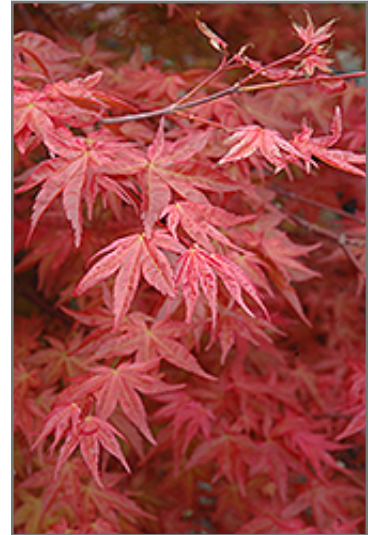
Suminagashi Japanese Maple foliage

This tree does best in full sun to partial shade. You may want to keep it away from hot, dry locations that receive direct afternoon sun or which get reflected sunlight, such as against the south side of a white wall. It prefers to grow in average to moist conditions, and shouldn't be allowed to dry out. It is not particular as to soil pH, but grows best in rich soils. It is somewhat tolerant of urban pollution, and will benefit from being planted in a relatively sheltered location. Consider applying a thick mulch around the root zone in winter to protect it in exposed locations or colder microclimates. This is a selected variety of a species not originally from North America.