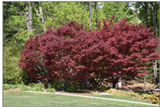
Suminagashi Japanese Maple