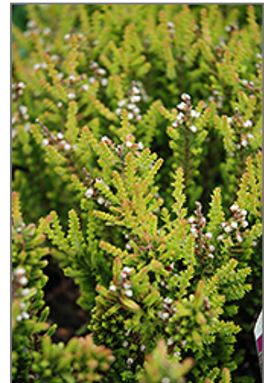
Firefly Heather foliage