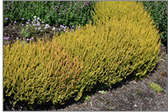
Firefly Heather

This shrub should only be grown in full sunlight. It requires an evenly moist well-drained soil for optimal growth, but will die in standing water. It is very fussy about its soil conditions and must have sandy, acidic soils to ensure success, and is subject to chlorosis (yellowing) of the foliage in alkaline soils. It is somewhat tolerant of urban pollution, and will benefit from being planted in a relatively sheltered location. Consider applying a thick mulch around the root zone in winter to protect it in exposed locations or colder microclimates. This is a selected variety of a species not originally from North America.