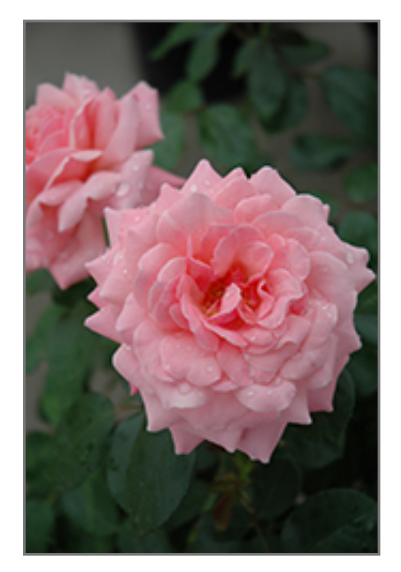
Sexy Rexy Rose flowers