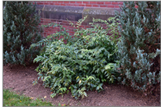
Rainbow Fetterbush