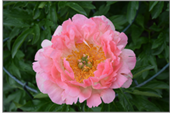
Coral Sunset Peony flowers (faded)