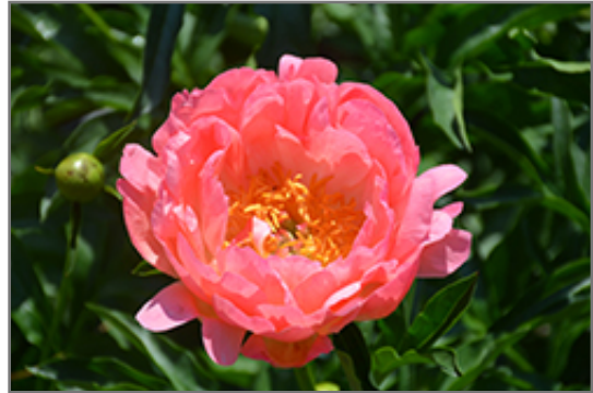
Coral Sunset Peony flowers