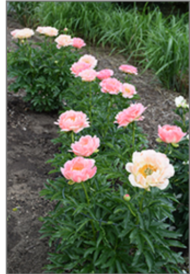
Coral Sunset Peony in bloom

This plant does best in full sun to partial shade. It does best in average to evenly moist conditions, but will not tolerate standing water. It is not particular as to soil pH, but grows best in rich soils. It is somewhat tolerant of urban pollution. This particular variety is an interspecific hybrid. It can be propagated by division; however, as a cultivated variety, be aware that it may be subject to certain restrictions or prohibitions on propagation.