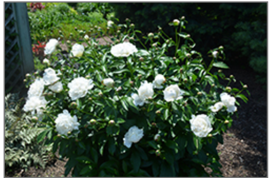
Festiva Maxima Peony in bloom