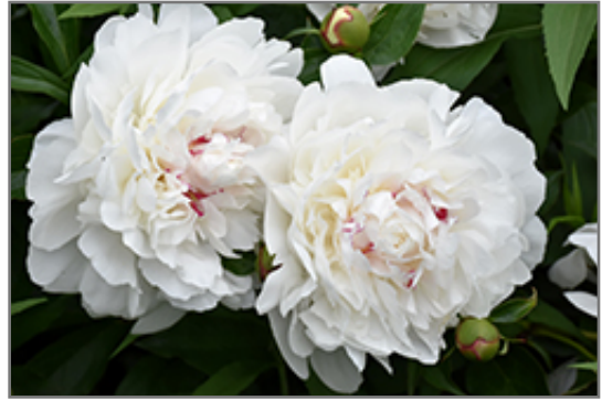
Festiva Maxima Peony flowers

Festiva Maxima Peony is recommended for the following landscape applications;